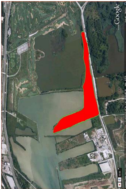
40 Acres, Eastern Shore Lake Calumet

CALL TO ACTION: SUPPORT Senate Bill 3778 , transferring 40 acres of land on the eastern shore of Lake Calumet from the Illinois Port District to the Chicago Park District for public recreation and conservation purposes. Initially granted to the Port District in 1957 by the State of Illinois, along with 1,500 total acres, these 40 acres have never been developed or used for port activities . Instead the eastern shore, habitat for wildlife and birds, has been fenced off with barb wire to prevent public access. The City of Chicago published the Calumet OpenSpace Reserve Plan which advocates for both recreation and conservation and public access to Lake Calumet. To voice your support, contact your elected officials: http://www.elections.illinois.gov/DistrictLocator/SelectSearchType.aspx?NavLink=1