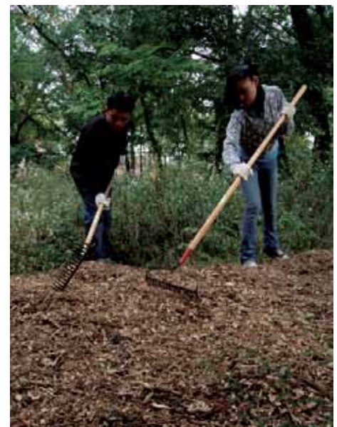
Volunteers collected seeds for the prairie at Gompers Park.