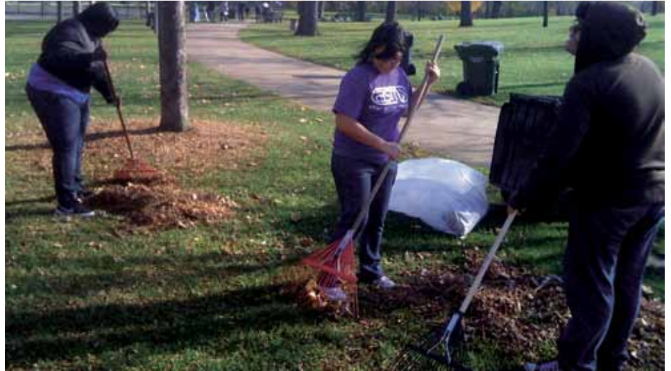
Friends of the Parks' Earth Team members raked leaves at Horner Park during the first-ever Great Rake Off! event in November.

The volunteer effort cleared hundreds of pounds of leaves from parks around the city. 🌿