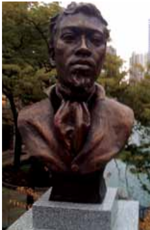
In October, the City of Chicago, the local Haitian community, and the DuSable Coalition dedicated a new sculpture of Jean Baptiste Pointe DuSable on Pioneer Court.