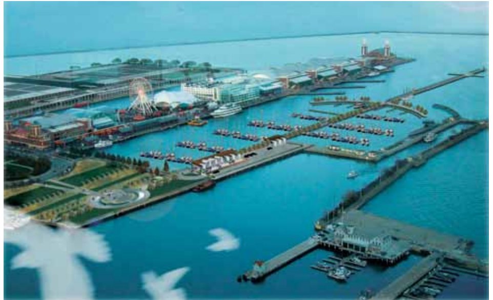
The rendering above shows the proposed harbor facility in the heart of downtown between the Chicago River Locks and Navy Pier.

The new Gateway Harbor will restore and widen Dime Pier and extend it to the west, connecting it with Gateway Park, the park in front of Navy Pier. As a public facility, the new pier will provide space for sitting, strolling, fishing, viewing the skyline, watching the fireworks and