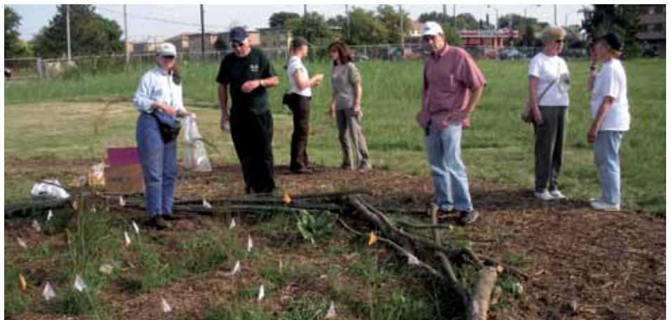
Volunteers planted 1,000 native plant plugs, constructed seating areas and installed a three-quarter mile woodchip walking path at the Dunning-Read Conservation Area on the city's Northwest Side.