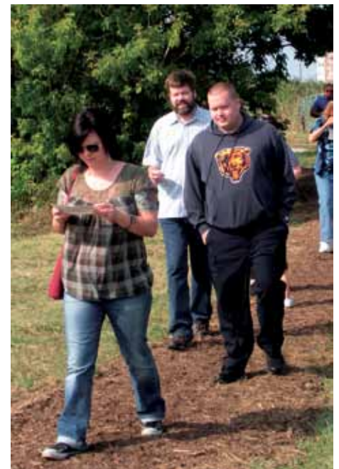
Visitors can now enjoy the land at the Dunning-Read Conservation Area, only the second dedicated conservation area in the City of Chicago.