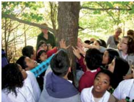
During a Friends of the Parks' Nature Along the Lake program outing, fourth graders from McCutcheon School investigate a tree full of woodpecker holes.

On the high school level, our Earth Team environmental apprentices continue their work with After School Matters this fall. Led by experienced instructors, Earth Team teens engage in environmental studies and community stewardship projects