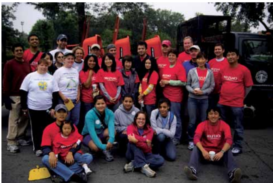
Volunteers from Mizuho Corporate Bank and Building with Books mulched trees at Columbus Park on National Public Lands Day.