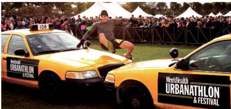
Urbanathlon course challenges included leaping over taxi cabs.