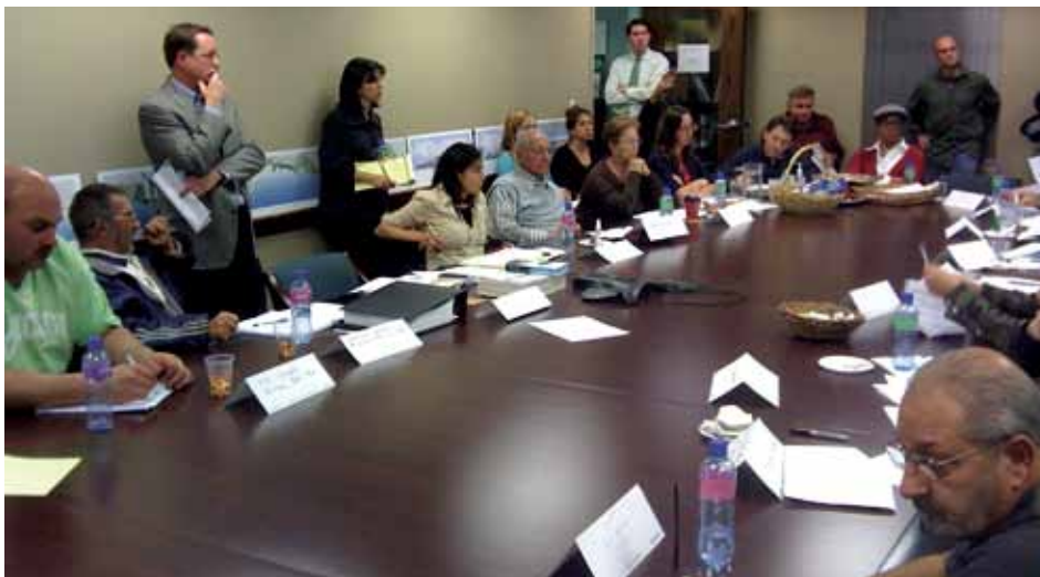
Friends of the Parks hosted a successful Park Advisory Council Networking session in November.