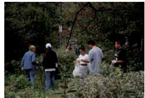
Volunteers from throughout the city and county helped clean and green their local parks and preserves – these photo's are from Gompers Park.

up litter, and clean playgrounds at Columbus Park, Gompers Park, Grand Crossing Park, Busse Woods, and Whistler Woods. Volunteers from Mizuho Corporate Bank returned to Columbus Park on Chicago's west side to mulch trees, remove litter and clean the playground. 🌱