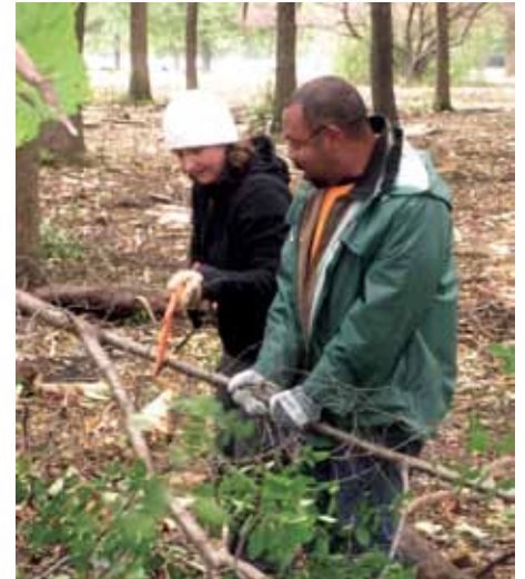
Motorola brought more than 400 employees out to remove invasive plants and trash from Busse Woods on October 14.