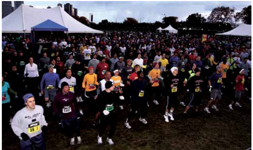
More than 2,000 participants took part in the Men's Health Urbanathlon on October 17.

The Men's Health Urbanathlon™ & Festival took place on Saturday, October 17. Over 2,000 people participated in the 12-mile relay race through Chicago's historic districts, great parks and iconic locations like Navy Pier, Northerly Island, and the stairs at Soldier Field. Some of the course challenges included leaping over the hoods of taxi cabs, crawling through cement cylinders and climbing over a six-foot wall. For the third year in a row, Men's Health magazine selected Friends of the Parks as one of the event's non-profit beneficiaries. The event increased park usage, promoted health and fitness, and showed off Chicago's architecture. 🌿