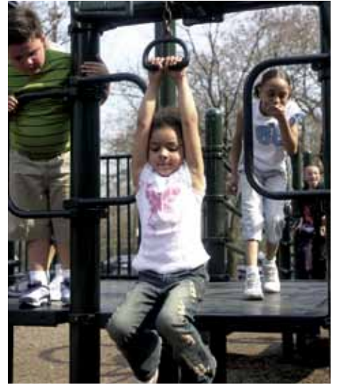
Children's playgrounds offer city kids a great place to play!