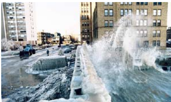
Parks at the former U.S. Steel South Works site (below) will offer new vistas of the lakefront and skyline. New peninsulas (bottom) can protect lakeside buildings from lake storms (above, South Shore in 1987), and shelter quiet lagoons, providing new places to safely enjoy kayaks and canoes.

Most important of all, it creates places that all city residents can enjoy: new places to walk, bike, wade, explore nature or just gaze out over the expanse of Lake Michigan. A century after the Plan of Chicago, Daniel Burnham's exhortation that "not a foot of its shores should be appropriated by individuals to the exclusion of the people" still offers compelling logic to complete the Last Four Miles.