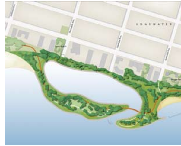
An alternate Edgewater proposal creates two peninsulas enclosing a new lagoon, with a bridge for the lakefront path.

Heavily used Berger Park is expanded with additional parkland and a new beach, within easy reach of families and children attending park programs.