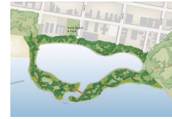
An alternate proposal for the area between 71st and 75th places lakemill offshore to create two peninsulas, with a bridge for the lakefront path across the new lagoon.

Innovative landscaping creates wildlife habitat and benefits the Lake Michigan ecosystem. Some 400 new acres of new parkland along the south lakefront will attract migrating birds following the shoreline.