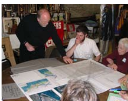
Park plans were developed by the residents of adjacent communities.

The concept plan includes completion of the lakefront path from 71st Street to the Indiana State Line, with connections to neighborhoods and bike trails in South Chicago and the Calumet region. Based on engineering and environmental studies, the design includes almost 400 acres of new parkland, with new beaches, recreational fields, greenways, and nature areas for South Chicago neighborhoods, which urgently need additional parkland.