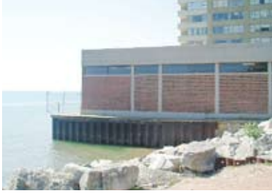
A continuous path, instead of barriers to lakefront access, would greet lakefront visitors. New natural areas (right) would enhance the Rogers Park area.