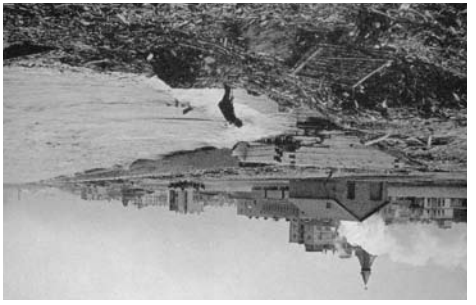
The lakefront as a dumping ground, circa 1909 (below), and Burnham's vision for Grant Park (above).

A cove in the 1850s to convert the city's lakefront cemetery into a public park was followed in 1869 by the creation of Lincoln Park. Through the purchase of 300 acres along the north lakeshore by 1905 along the south lakefront, Frederick Law