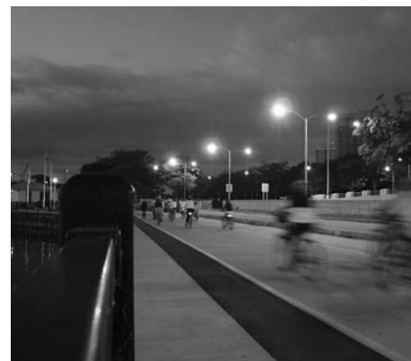
During the last five miles of the course, cyclists ride along Chicago's spectacular lakefront bicycle path from Foster Avenue south through the Museum Campus. Many catch a glimpse of the sunrise toward the end of their trek.