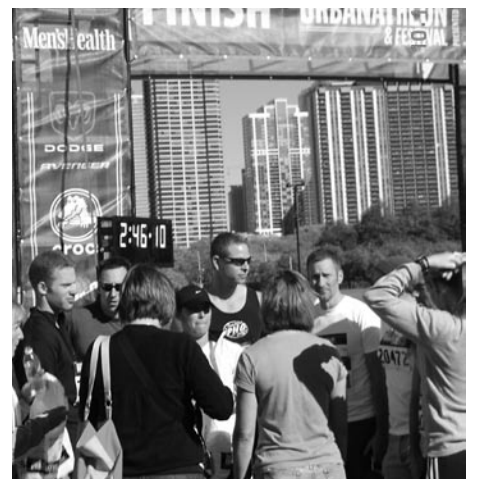
Participants celebrate at the finish line of the Urbanathlon in Grant Park.