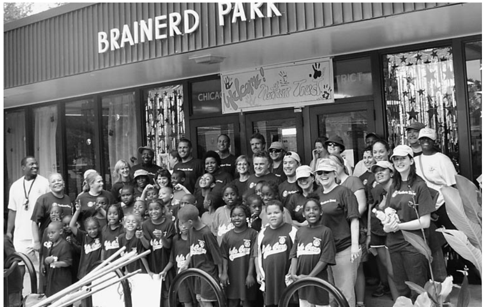
Friends of the Parks led volunteers from Northern Trust and community children during a clean-up at Brainerd Park.

Friends of the Parks extends our warmest thanks to the Ford Motor Company for their support of this year's Public Lands Day Parks and Preserves Stewardship Day.