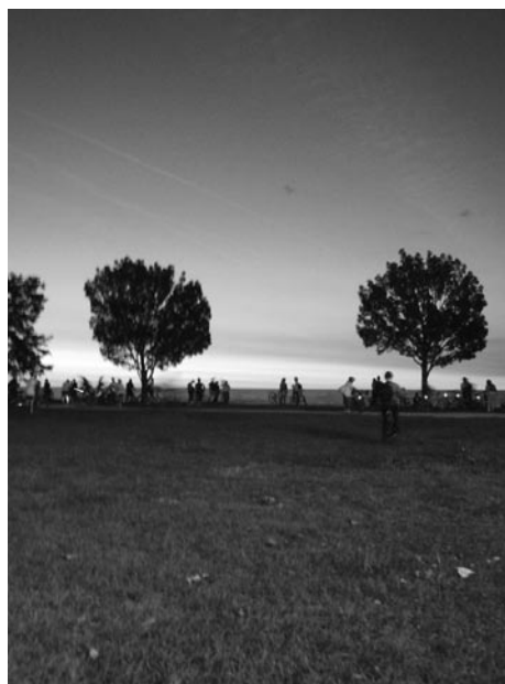
During the ride, many participants stop along the beautiful lakefront to view the sunrise.