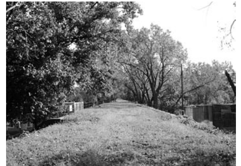
This photo shows part of a 2.5 mile abandoned rail line which the Sustainable Englewood Project hopes to turn into a nature trail.