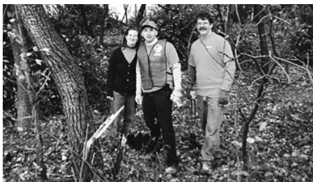
During a major clean-up day organized by Friends of the Parks, Motorola employees volunteered to clear buckthorn in order to create a beautiful view of the lake at Busse Woods.

Friends of the Parks commends Motorola for its Global Day of Service efforts to give back to the community. 🌱