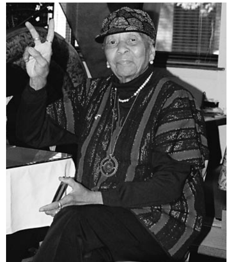
Admirers, friends and supporters helped Dr. Margaret T.G. Burroughs celebrate her 90th birthday.

sented their poetry, essays and artwork. Finally, on the third day, November 3, the DuSable Museum of African American History celebrated Dr. Burroughs as its founder with a gala celebration. 🌿