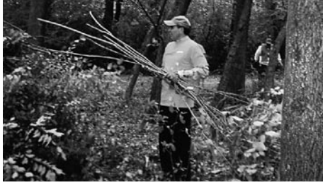
Motorola CEO Ed Zander pitched in on Motorola Global Day of Service at Busse Woods, where Friends of the Parks organized a major clean-up day for the corporation's employees.