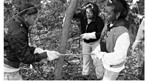
Apprentices from the Roosevelt High School Earth Team work hard at Edgebrook Woods.

High school students are engaged in Friends of the Parks' After School Matters programs through the Earth Team and CYCLE (Chicago's Youth Changing Local Environments) programs. Earth Teams offer apprenticeship opportunities for 125 teens to work at five locations, including Calumet Park, Horner Park, Humboldt Park, Norwood Park and Roosevelt High School. Students learn about and improve their local park environment. In addition to daily after-school environmental activities and projects, Earth Team teens are linked with local environmental organizations and professionals in Chicago. Fieldtrips so far have included a behind-the-scenes look at Lincoln Park Zoo,