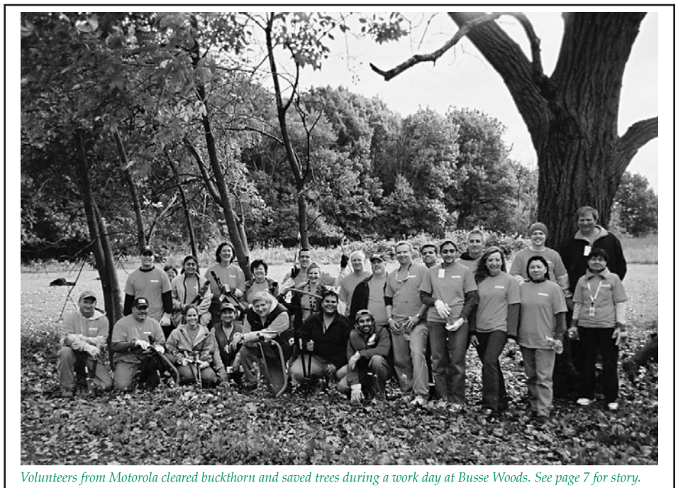
Volunteers from Motorola cleared buckthorn and saved trees during a work day at Busse Woods. See page 7 for story.

In sum, Friends of the Parks does not support the Children's Museum as currently proposed for Grant Park because it violates the important laws created to protect that park. 🌿