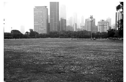
Despite strong opposition, The Latin School of Chicago wants to construct an artificial turf soccer field at the south end of Lincoln Park.

Looking forward, Friends of the Parks encourages the Park District to develop a policy and plan that calls for the District to construct public soccer fields that are open for permitted use by the general public. 🌿