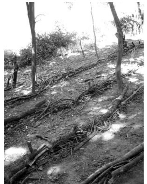
The Edgebrook Earth Team completed terraces, providing a fertile launching pad from which eager seedlings can shoot up in the spring and reclaim the forest floor.

Plans are now underway to add another new forest preserve-based Earth Team next summer based at a South Side preserve. For more information, contact Cassie Hatzfeld, Education Program Director, at chatzfeld.fotp@yahoo.com or (312) 857-2757 extension 20. 🌱