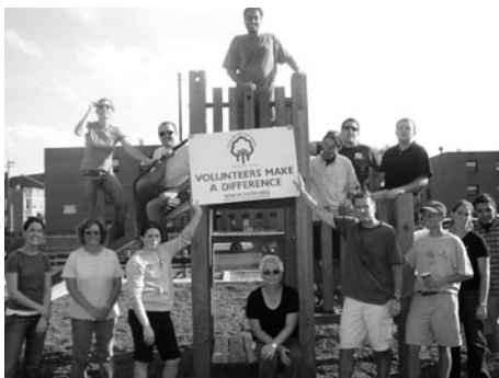
Volunteers from Chubb celebrate their work on the playground at Garfield Park.

We thank the following companies, schools and groups for serving as stewards for the environment. Their work on behalf of our parks and preserves makes a difference in Chicago.