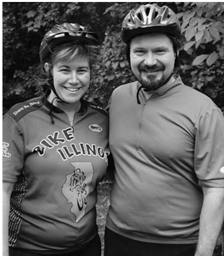
We had fantastic weather for the 3rd annual Fall Frolic: Bike the Preserves in September.

The ride took place on Sunday, September 17th. Riders traveled thirty miles through Caldwell Woods, Edgebrook Woods, Forest Glen Woods, Glenview