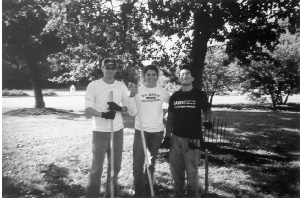
Volunteers from Washington Mutual participate with Friends of the Parks for National Public Lands Day in Columbus Park.

National Public Lands Day volunteers enjoyed Clif Bars, donated for the event, while they worked. 🌱