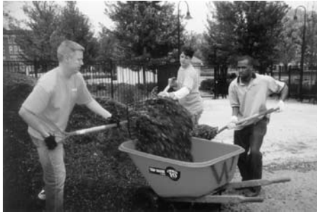
Volunteers from Motorola fill a wheelbarrow with mulch at Ogden Park.

Friends of the Parks has hosted thirty-two Community Service Days in Chicago parks and forest preserves this year. Many of these days happen because of the willingness of our advisory councils, schools, community groups and busi-