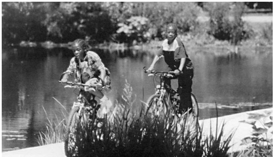
Two boys bike along the lagoon in historic Washington Park.