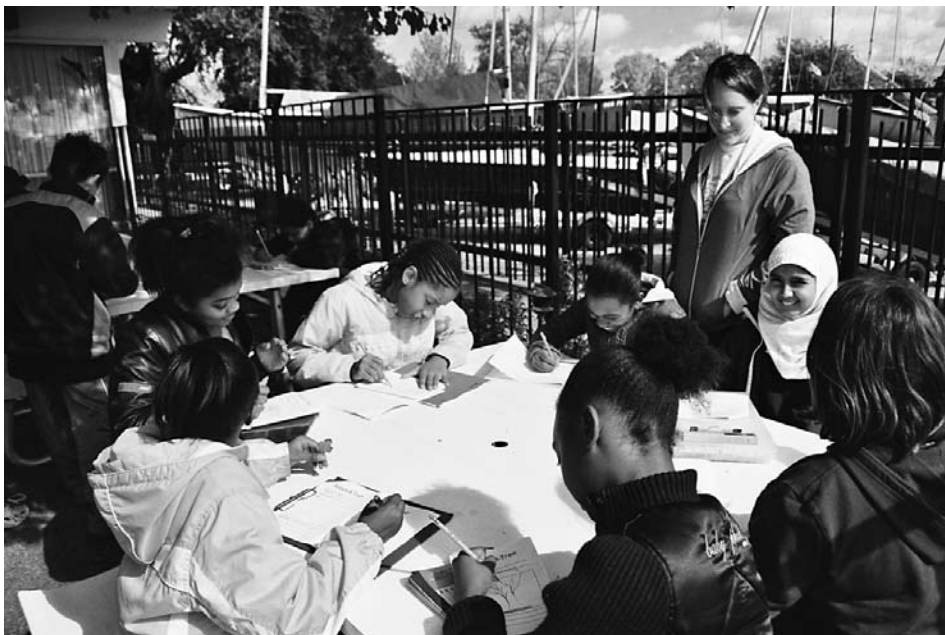
Students engage in environmental education as part of Friends of the Parks Nature Along the Lake Program

The Earth Team members total 25 teens from the north and 25 teens from the south who will be working together on several stewardship and environmental projects. While the teens learn a new appreciation for the environment, they also embrace the diversity of their peers and build a sense of comradery. ♻️