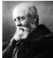
Frederick Law Olmsted

Each year, we seek membership gifts from caring citizens and families who want to assist us as we make Chicago's parks and forest preserves greener and safer.