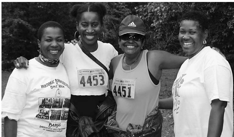
Fall Frolic participants enjoyed the beautiful scenery along the North Branch Bicycle Trail.

Woods, Harms Woods and the Skokie Lagoons to the Chicago Botanic Garden. Riders toured the beautiful gardens and enjoyed refreshments before heading back south, finishing the event at Caldwell Woods.