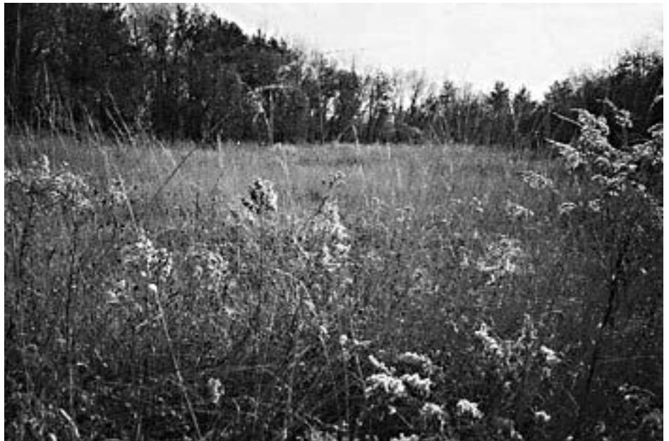
With the lifting of the restoration ban, prairies such as this one can be restored by volunteers, students and District staff.

including representatives from Friends of the Parks, Brookfield Zoo, the Chicago Botanic Garden, U.S. Fish and Wildlife, Friends of the Forest Preserves, Audubon Society, The Nature Conservancy, North Branch Restoration Project, Des Plaines River Valley Volunteers, Openlands, Corlands and others. 🌿