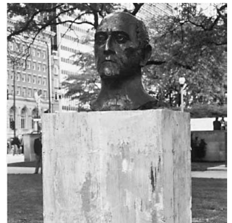
The Solti Bust in its new Grant Park location across from Orchestra Hall.