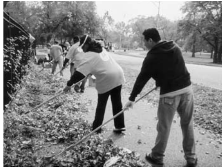
Motorola volunteers rake the perimeter of Ogden Park as part of their Community Service Day.

nesses to participate in making parks and preserves cleaner and safer.