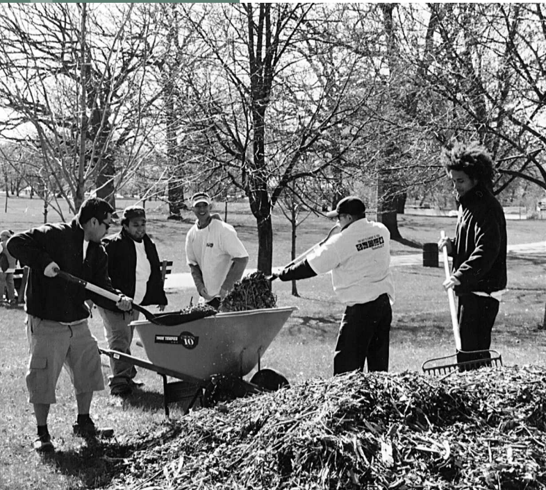
Volunteers spread mulch at the base of a tree in Gompers Park during National Public Lands Day.